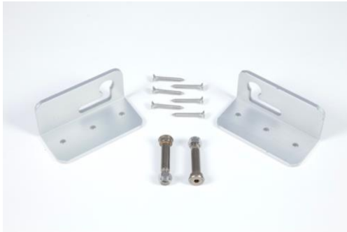
Figure 7 - Fixing Plate and screws

Fixing plates are available for those who wish to secure the ramp to the step. This is an additional purchase and not included with the ramp.