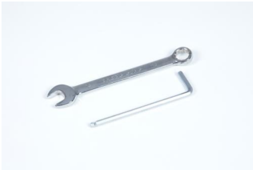
Figure 1 – Allan Key and Wrench

Allan key and wrench is provided with all ramps to allow you to add or remove sections when required