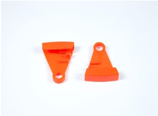
Figure 4 – Anti-pinch covers

Anti-pinch covers are provided on both sides of the RollAble ramp, we recommend using these at all times. If you wish to remove a section of the ramp you will also need to remove the relevant anti-pinch cover.