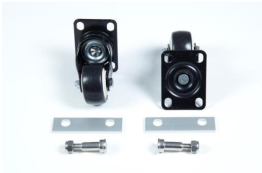
Figure 8 – Wheels and Fixings

Wheels are available as an additional purchase. These are provided with fixings to secure them to the ramp. This is an additional purchase and not included with the ramp.