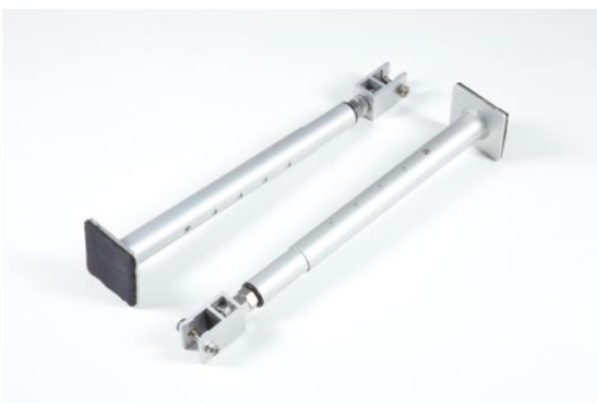
Figure 6 - Support legs

A pair of support legs are provided with ramps designed to be used at heights of 50cm or above, such as ramp lengths of 11ft. The support legs are adjustable at heights between 47cm – 63cm. The legs include fixings to secure these to the ramp. The support legs can be purchased separately if required.