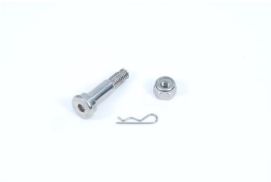
Figure 2 – Fixings

Fixings used to hold the ramp together, if you wish to reduce the ramp length you will need to use the allen key and wrench to unscrew the parts and remove a section.