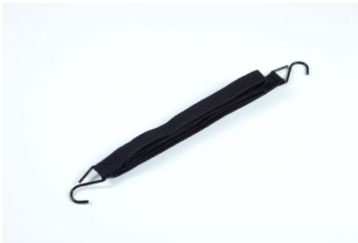
Figure 5 - Black Strap

A black strap is provided with all ramps and we recommend using this when the ramp is stored. To use simply roll the ramp up and place this around the ramp. Clip the black strap around the ramp to hold it shut.