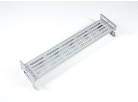
Figure 3 – Ramp Section

The ramps are made up of various sections, each section is circa 13cm by your chosen width. If you wish to reduce the ramp length you can use the allen key and spanner to remove these sections. Additional sections can also be purchased if you wish to extend your ramp length.